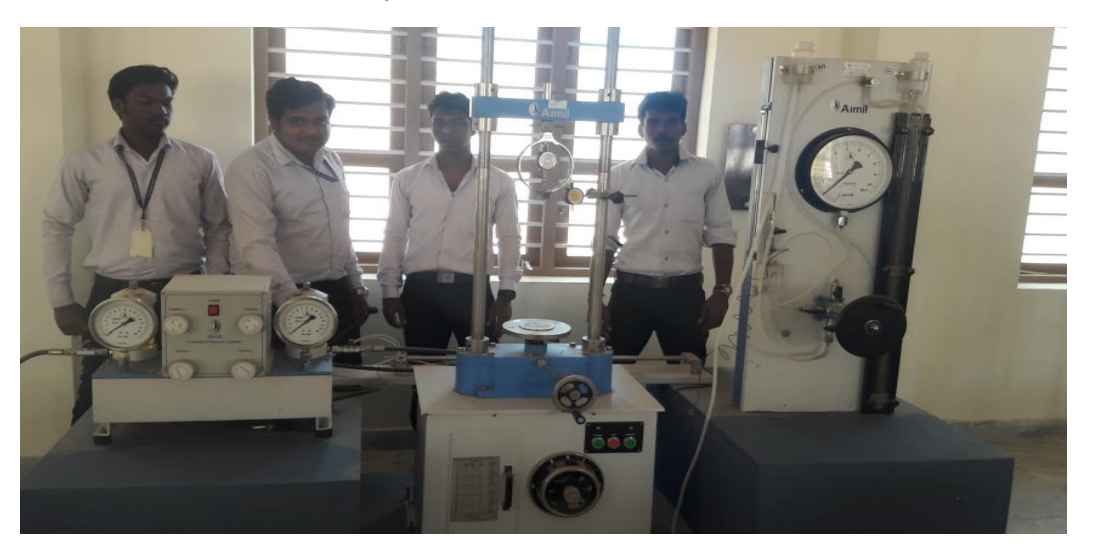
Environmental Engineering Laboratory