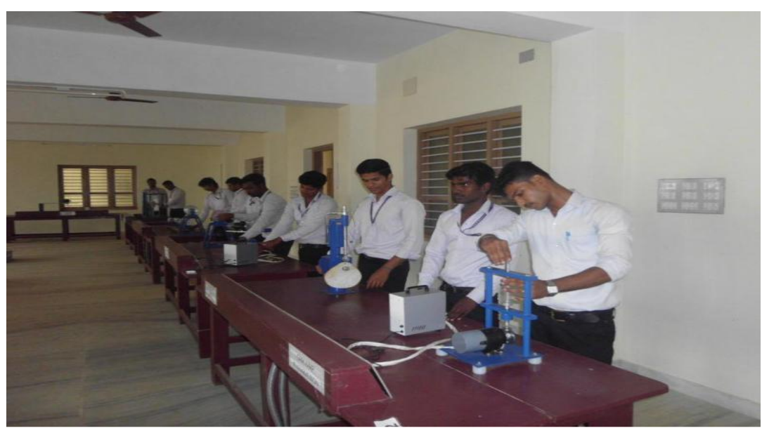
Strength of Materials Laboratory